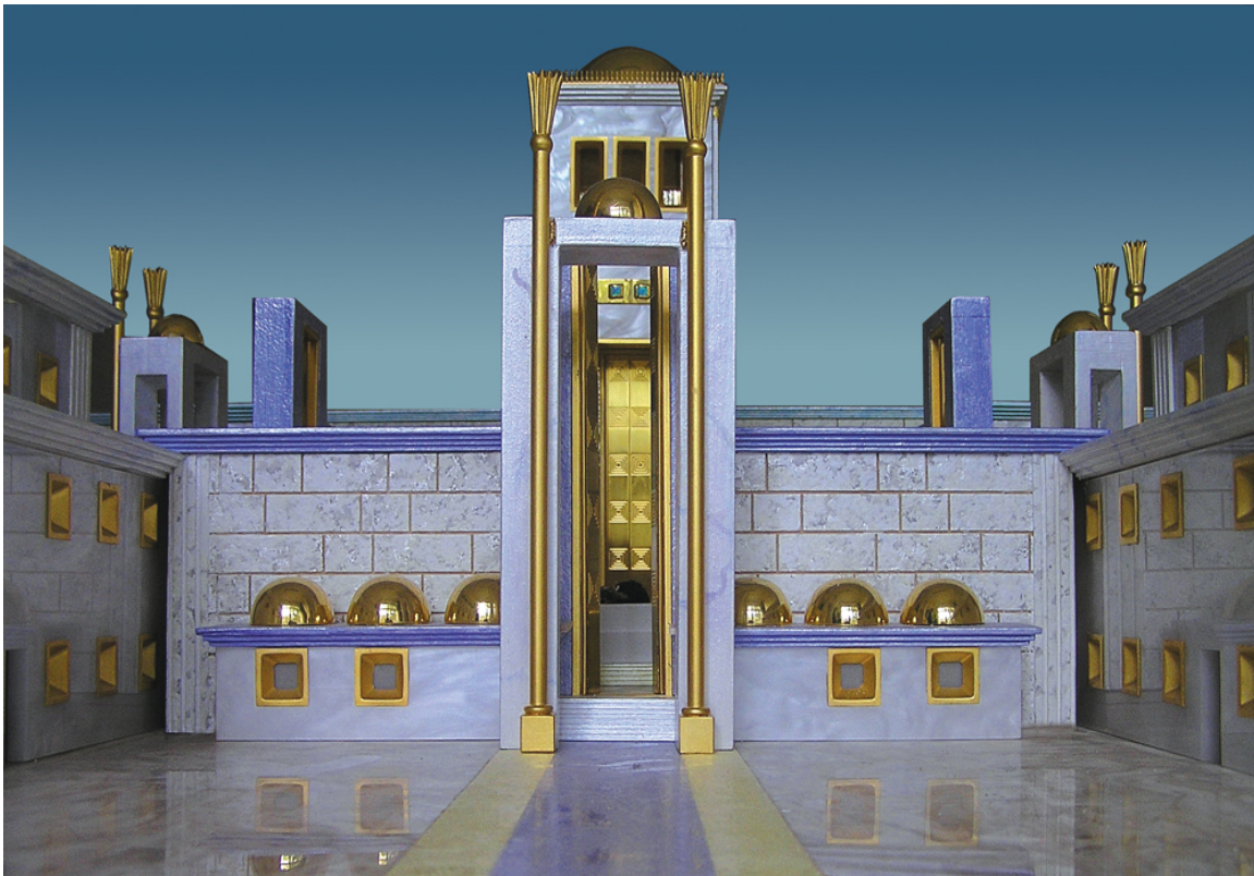
View From Outer Court of the East Gate to Inner Court East Gate From Messianic Temple https://menorahbooksnews.files.wordpress.com/2014/07/messianic-temple3.jpg

1 Thus saith the Lord Jehovah: The gate of the inner court that looketh toward the east shall be shut the six working days; but on the sabbath day it shall be opened, and on the day of the new moon it shall be opened. 2 And the prince shall enter by the way of the porch of the gate without, and shall stand by the post of the gate; and the priests shall prepare his burnt-offering and his peace-offerings, and he shall worship at the threshold of the gate: then he shall go forth; but the gate shall not be shut until the evening (ASV, 1901).