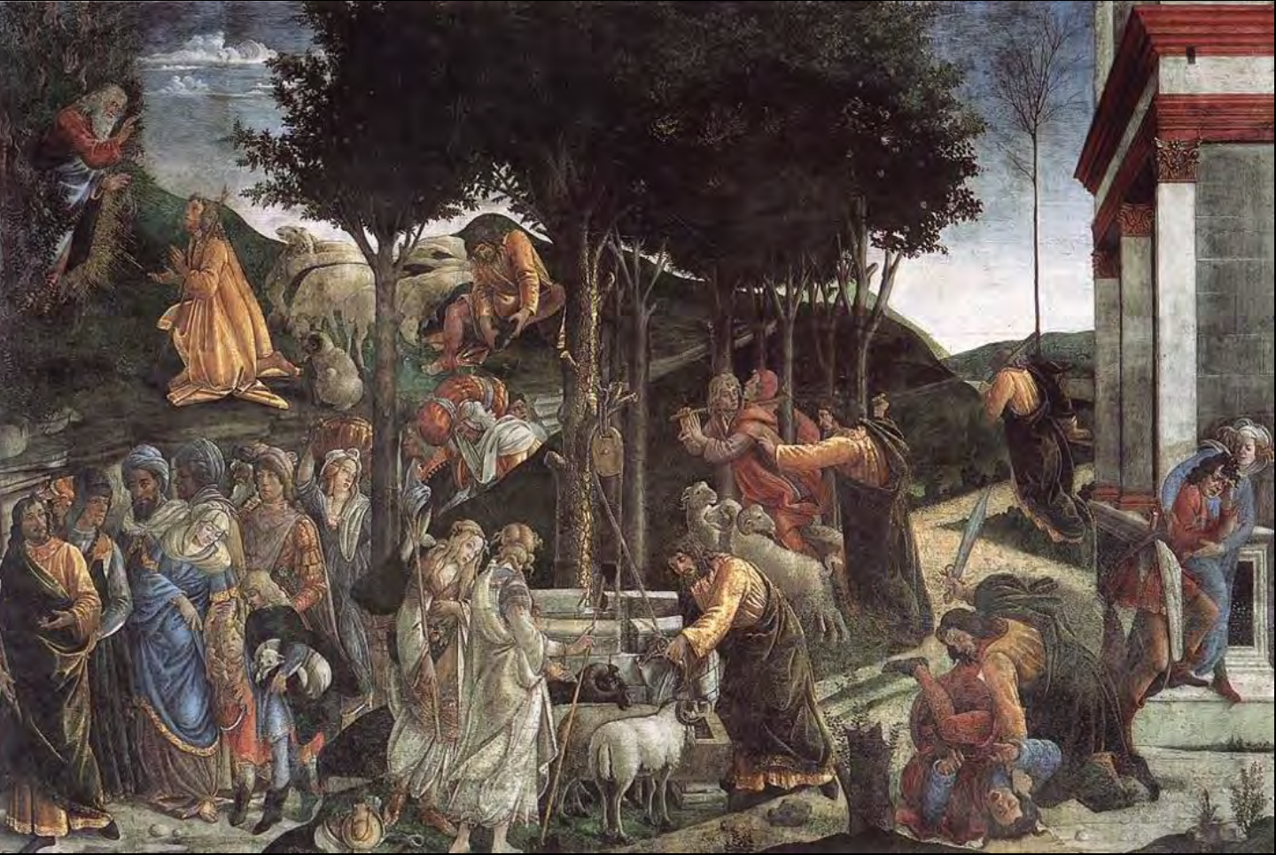
Scenes from the Life of Moses by Botticelli Cir. 1481, Sistine Chapel