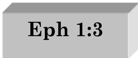
Outside of Box

Tonight, we will finish the first section of the longest sentence in the Greek NT. Beginning in v. 3 Paul gives a summary statement of vv. 4-14. This is a very Hebrew way of writing. It was common to give a summary and then expand in Hebrew thinking. For example, Gen. 1-2. Genesis 1 is a brief account of the creation of the entire universe. Genesis 2 expands upon day 6, giving the details. (Ezek. 38-39 follows a similar style). So, what this means is that Paul is saying nothing more in vv. 4-14 than he is saying in v. 3. vv. 4-14 are just an amplification of everything contained in v. 3. So, if you wanted a short statement summing up everything in vv. 4-14 you would just quote v. 3. Now, if you want to unpack v. 3, you would look to vv. 4-14. If v. 3 is the box then vv. 4-14 are everything in the box. You have to open the box to see everything in the box so that's why Paul launches into this complex sentence.