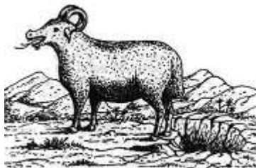
THE FALSE PROPHET

The first beast came out of the sea (13:1). The second beast comes out of the earth . Many think this means the false prophet is a Jew on the basis that he comes out of the earth . This interpretation is built on identifying the “sea” in 13:1 as Gentile nations and then contrasting that with the “earth” in 13:11 which must then refer to the Jews. In some cases “sea” does refer to the Gentile nations but not here because the “sea” is equivalent to the “abyss” in Rev 11:7. The “abyss” was the origin of the terrible demonic locusts in Rev 9 and the “sea” was considered the origin of the most terrifying monsters and demons. So the Antichrist will be a very powerful, very terrible, monster of a man with demonic doctrines. As per the second beast, there is not enough data to designate his ethnic background. God’s intention by saying he is a second beast coming out of the earth is to compare and contrast the terribleness of these two beasts to one another. In ancient thought, beasts out of the sea were considered the most terrifying. A beast out of the earth was terrible but not as terrible as a beast out of the sea. Another contrast is that the beast out of the sea has ten horns while the beast out of the earth has only two horns .