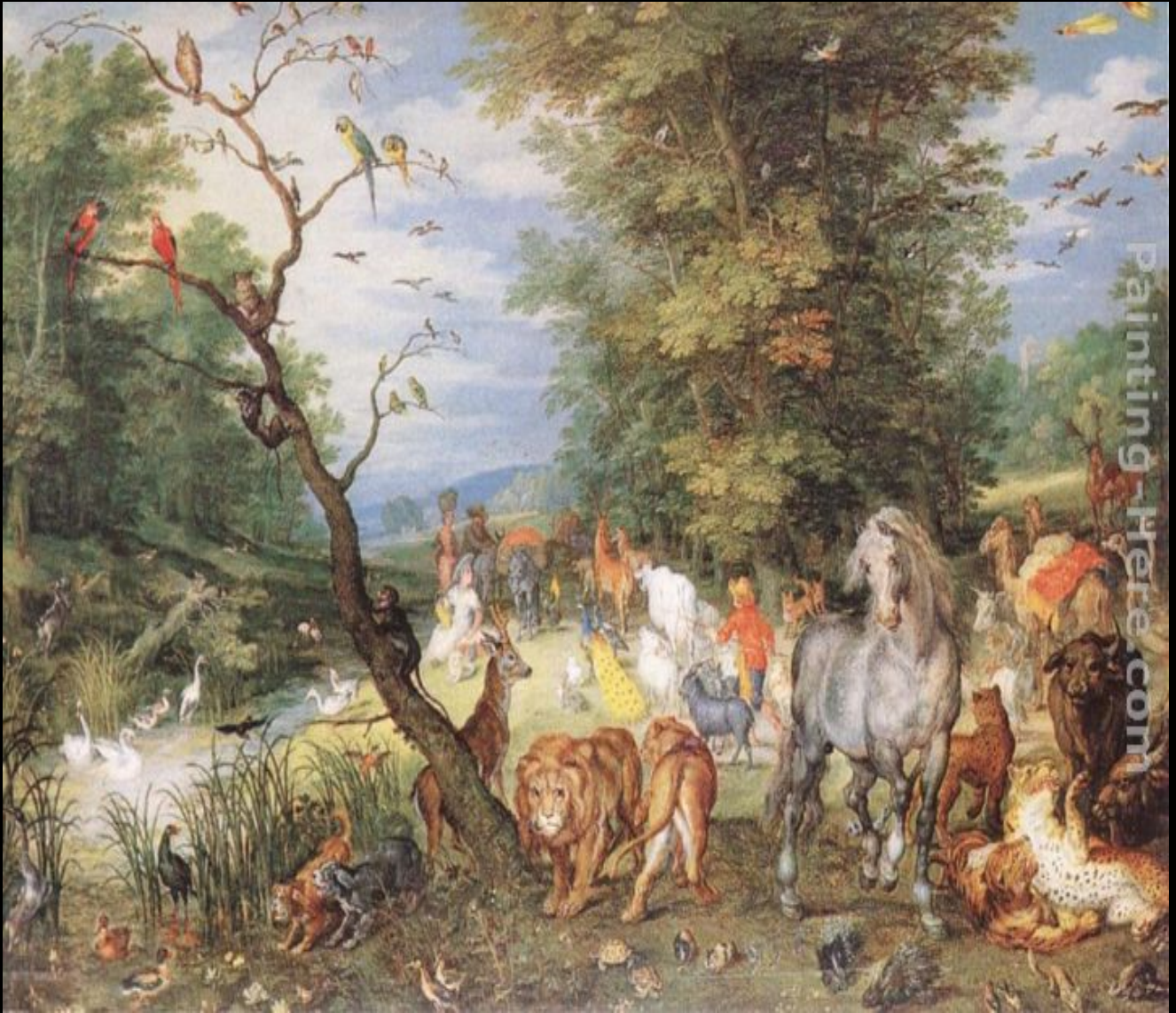
Painting by Jan Brueghel the Elder 1615