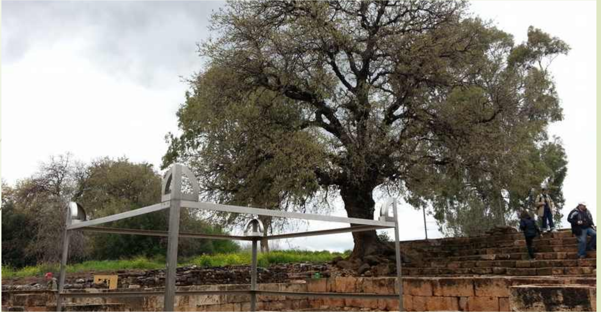
One of the “high places” in Israel