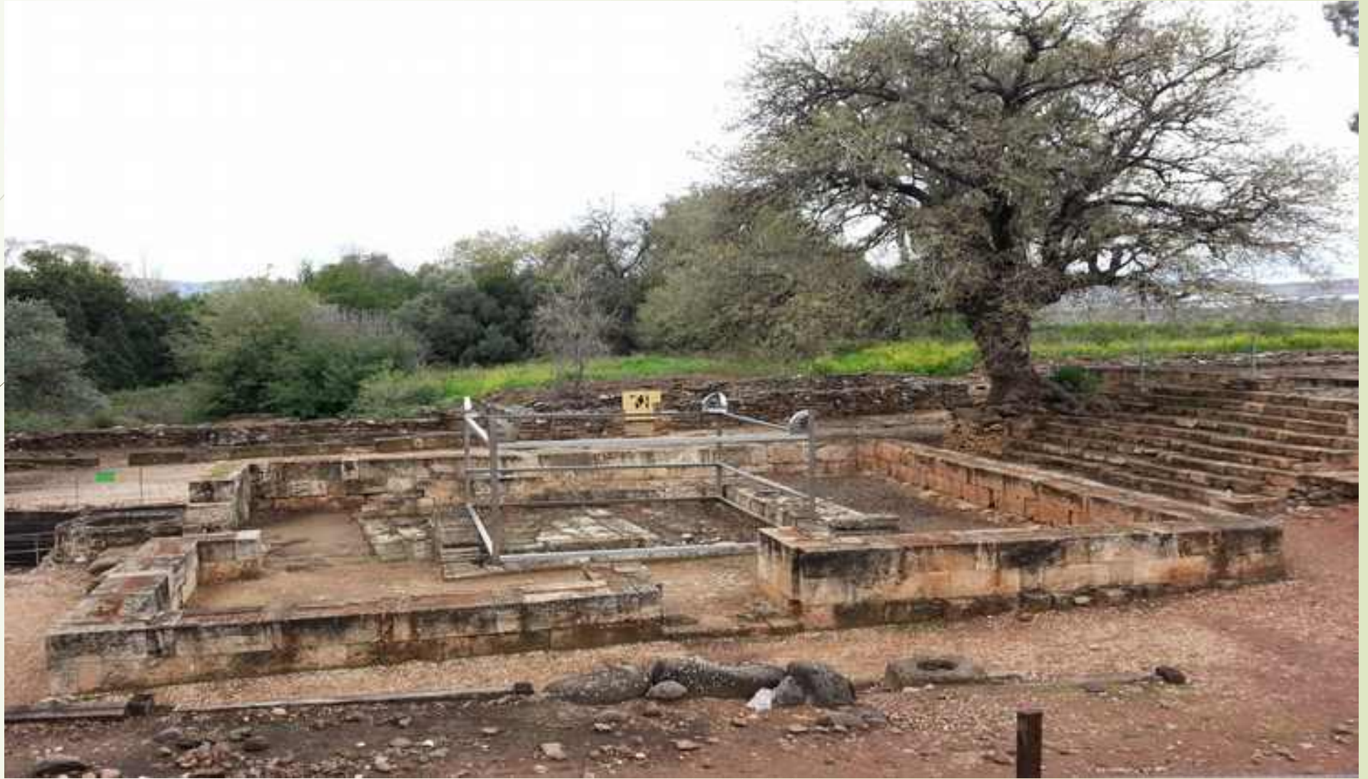
One of the “high places” in Israel