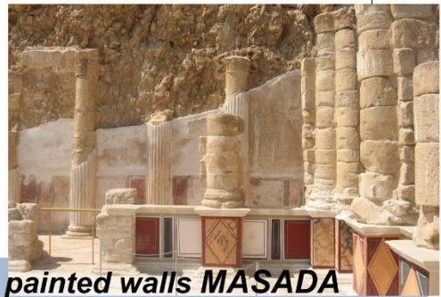
painted walls MASADA