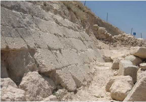
Rock covered sides of Herodium like armor scales

GALILEE Ruled later by Herod Antipas after Herod