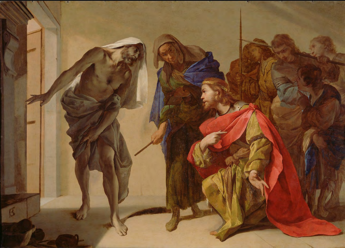
Saul Invokes the Ghost of Samuel by Bernardo Cavallino Cir 1652