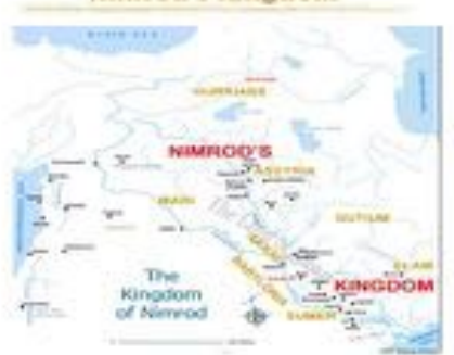
Post Nimrod Migrations