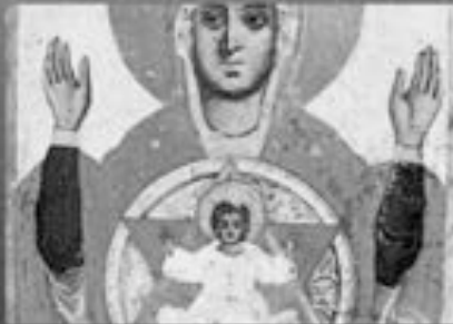
Greek Orthodox “Star”