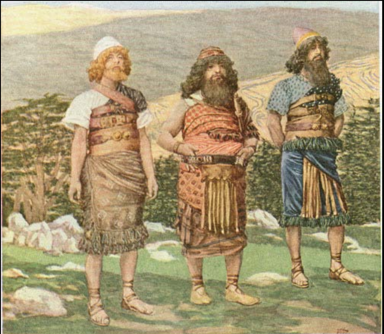
J. James Tissot.