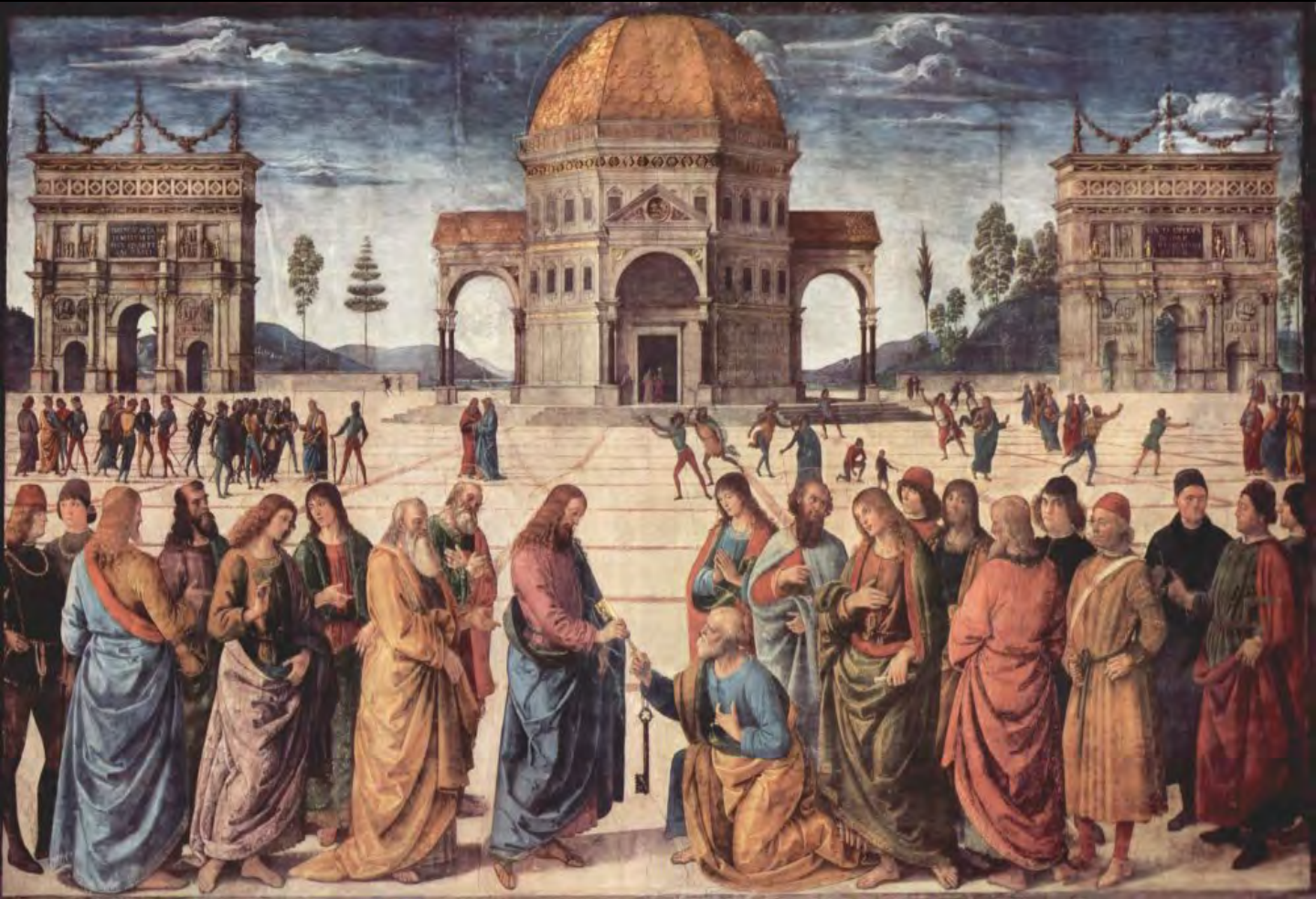
Jesus Handing the Keys to Peter by Peitro Perugino cir 1481-82