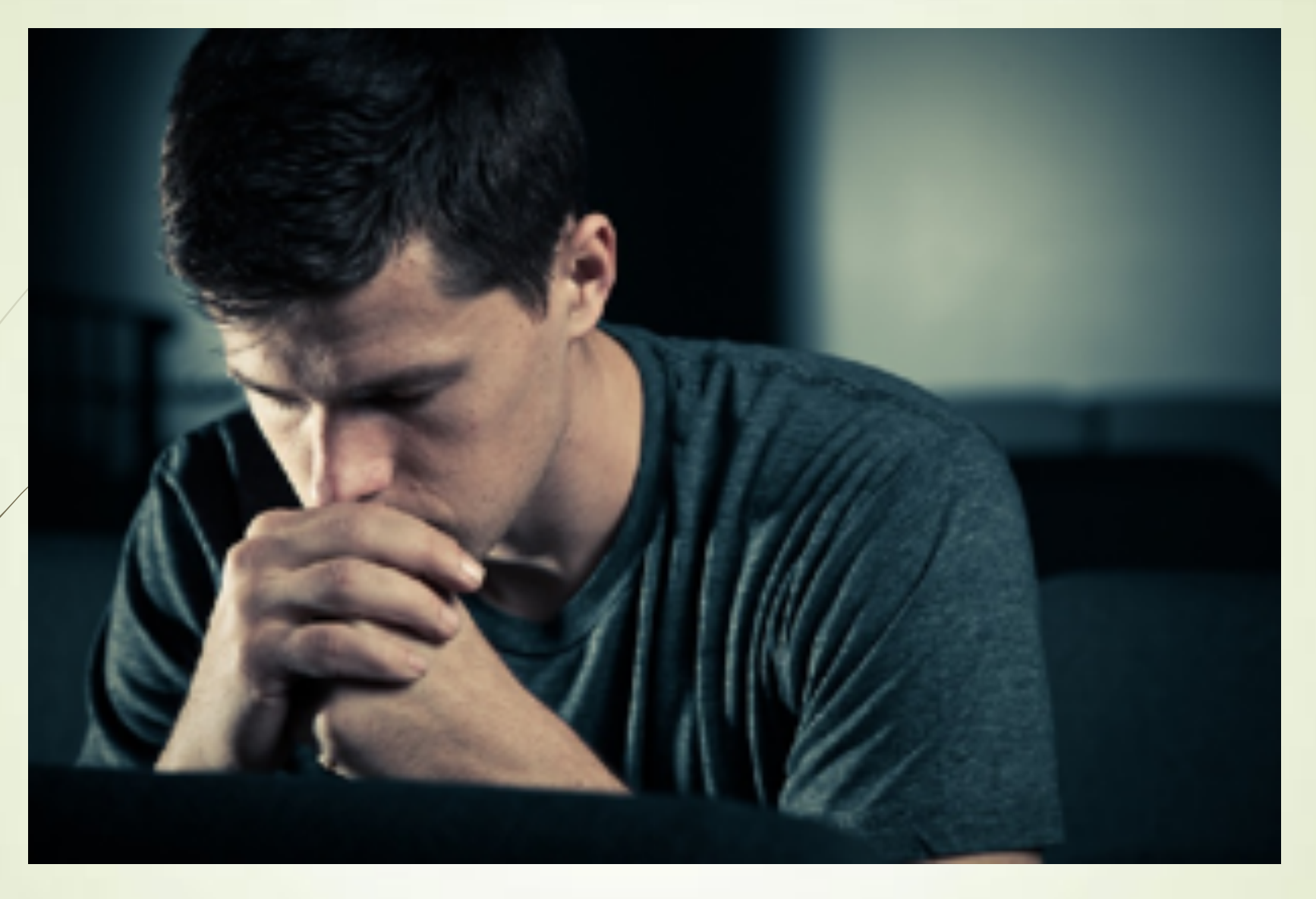
■ Is. 26:3; Is. 41:10