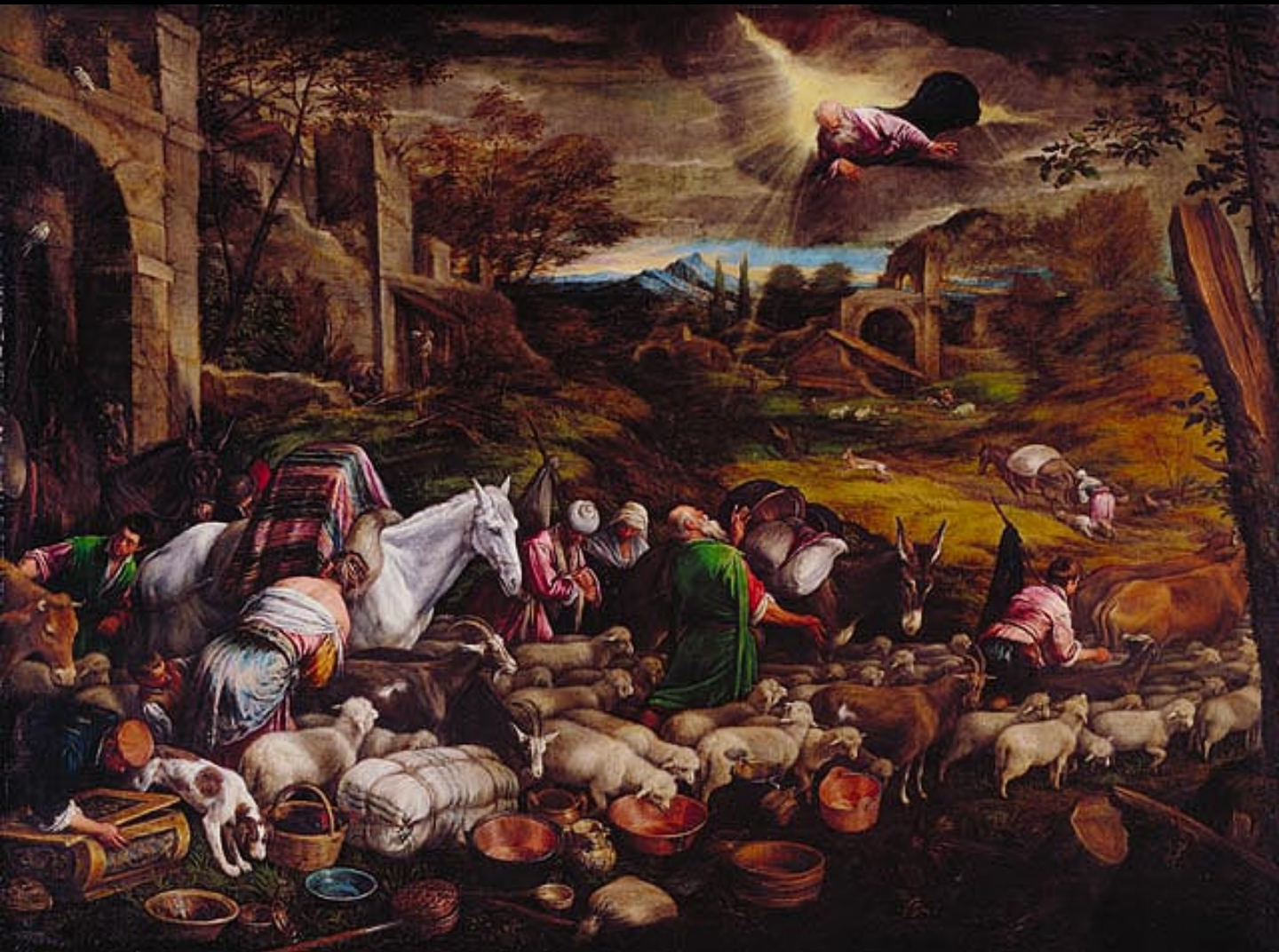
Departure of Abraham for Canaan by Jacopo Bassano Cir. 1570