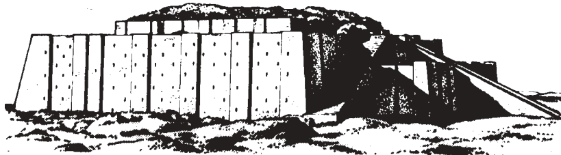
Partially-reconstructed temple-tower (ziggurat) at Ur shows how the Tower of Babel may have been built with stairways leading from one level to the next

It was, in all probability, a multi-storied temple-tower, or ziggurat, similar to those developed in Babylonia in the early 3rd millennium BC. It dominated the city, both architecturally and culturally. It would serve as the focal point of the political and religious life of the population, and would be a symbol of their unity and strength.