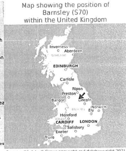
Contains OS data © Crown copyright and database right 2021