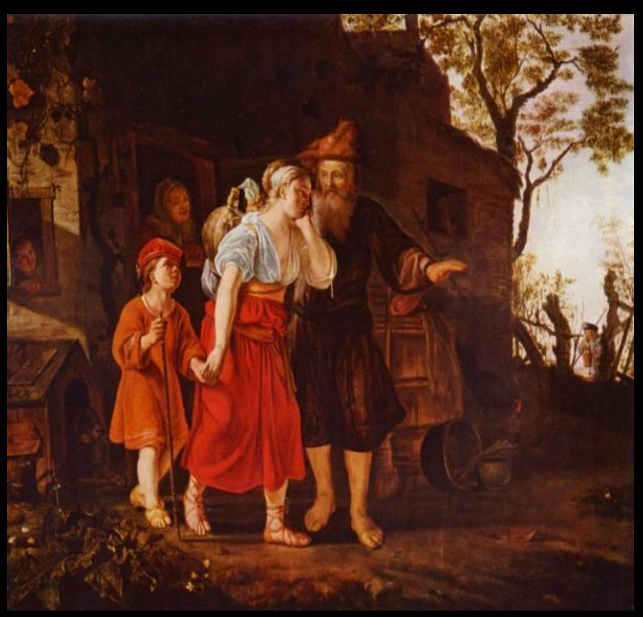
Jan Victors 1635

Isaac is Born & Ishmael is Expelled Genesis Message Forty-Eight Genesis 21: 1-21