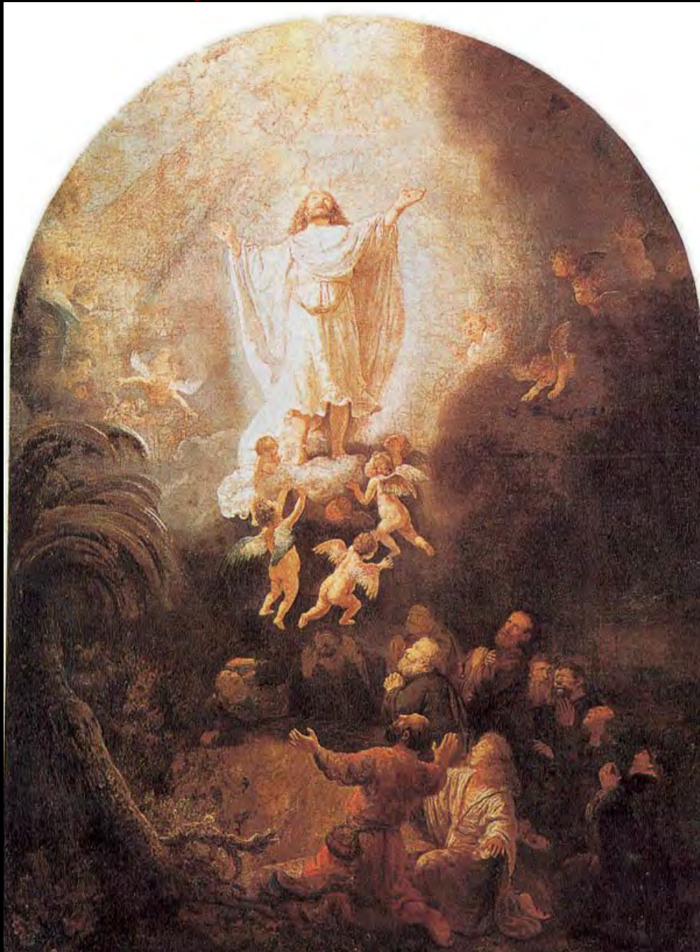
Ascension by Rembrandt Cir. 1636