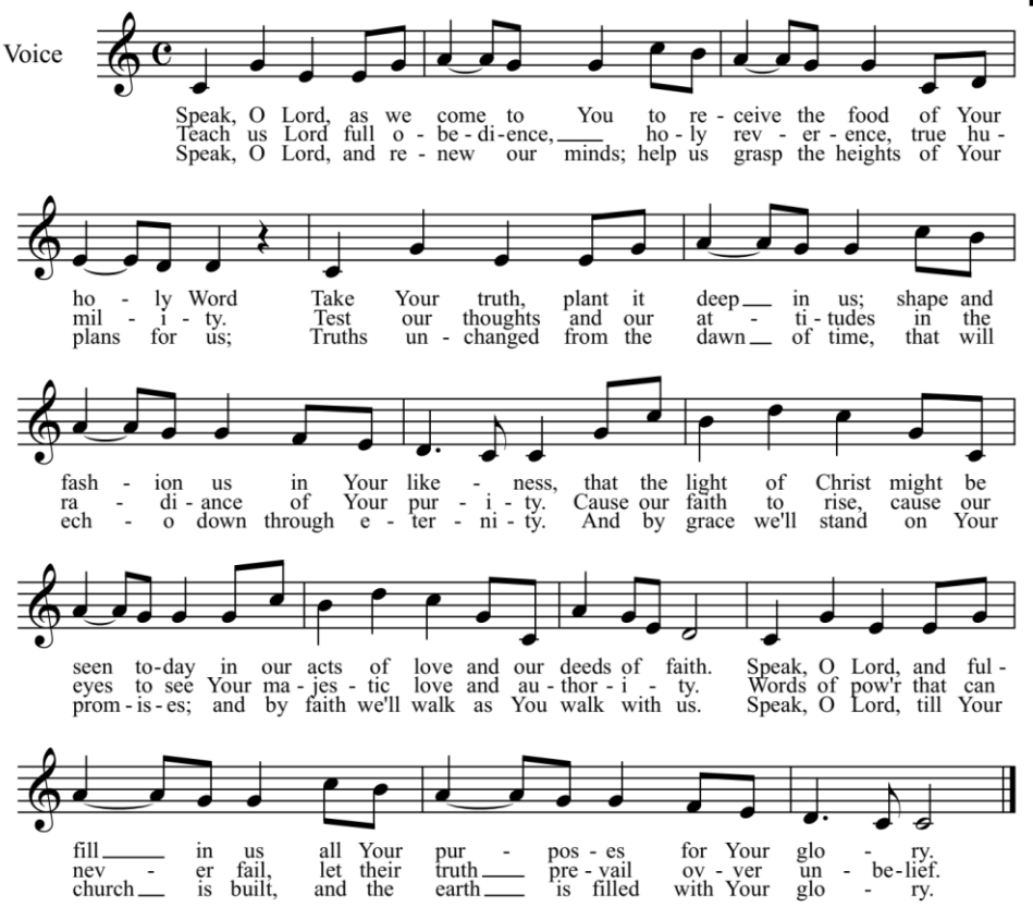
Words & Music by Keith Getty & Stuart Townend CCLI 82151