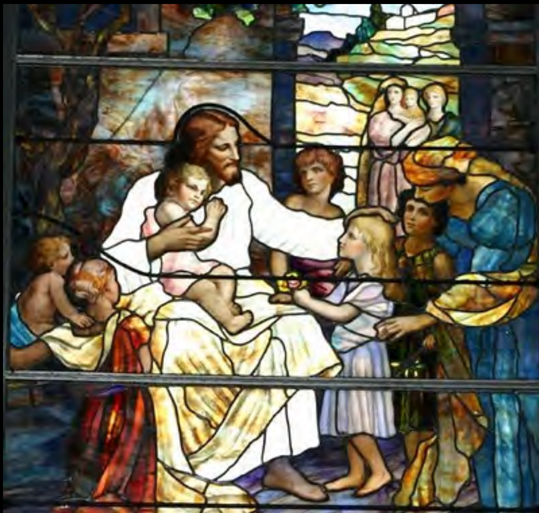
Jesus and the Children Artist Unknown