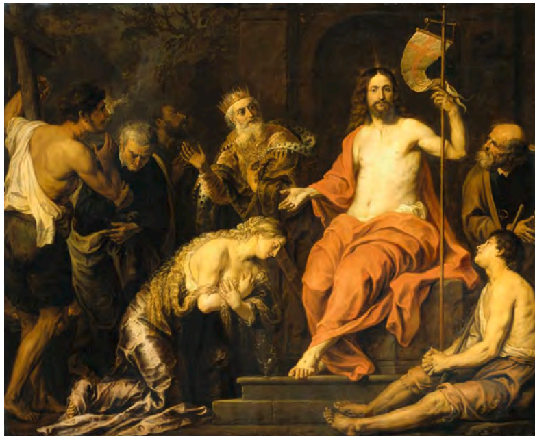
Christ and the Penitent Sinners by Gerard Seghers Cir. 535

WHO DO YOU SAY THAT I AM? THEREFORE WHO WILL BELIEVE?