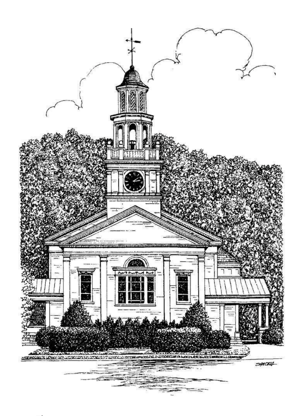
First Congregational Church of Woodstock

Declaring, "Jesus Christ is the same, yesterday, today, and forever." Hebrews 13:8