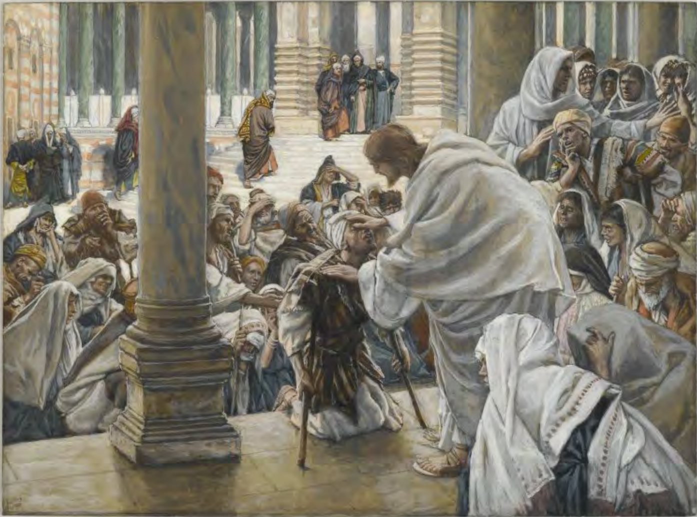
He Heals the Lame by James Tissot Cir. 1886-1894