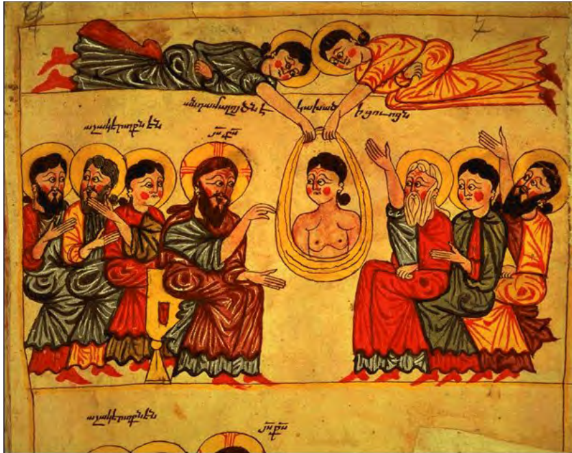
The Healing of the Lame of Capernaum Artist Unknown from Armenian Museum, Isfahan, Iran