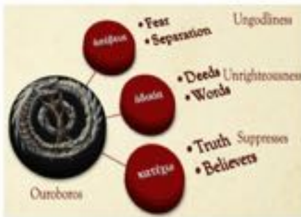
Pertains to Man and Woman after sin and Everyone ever born