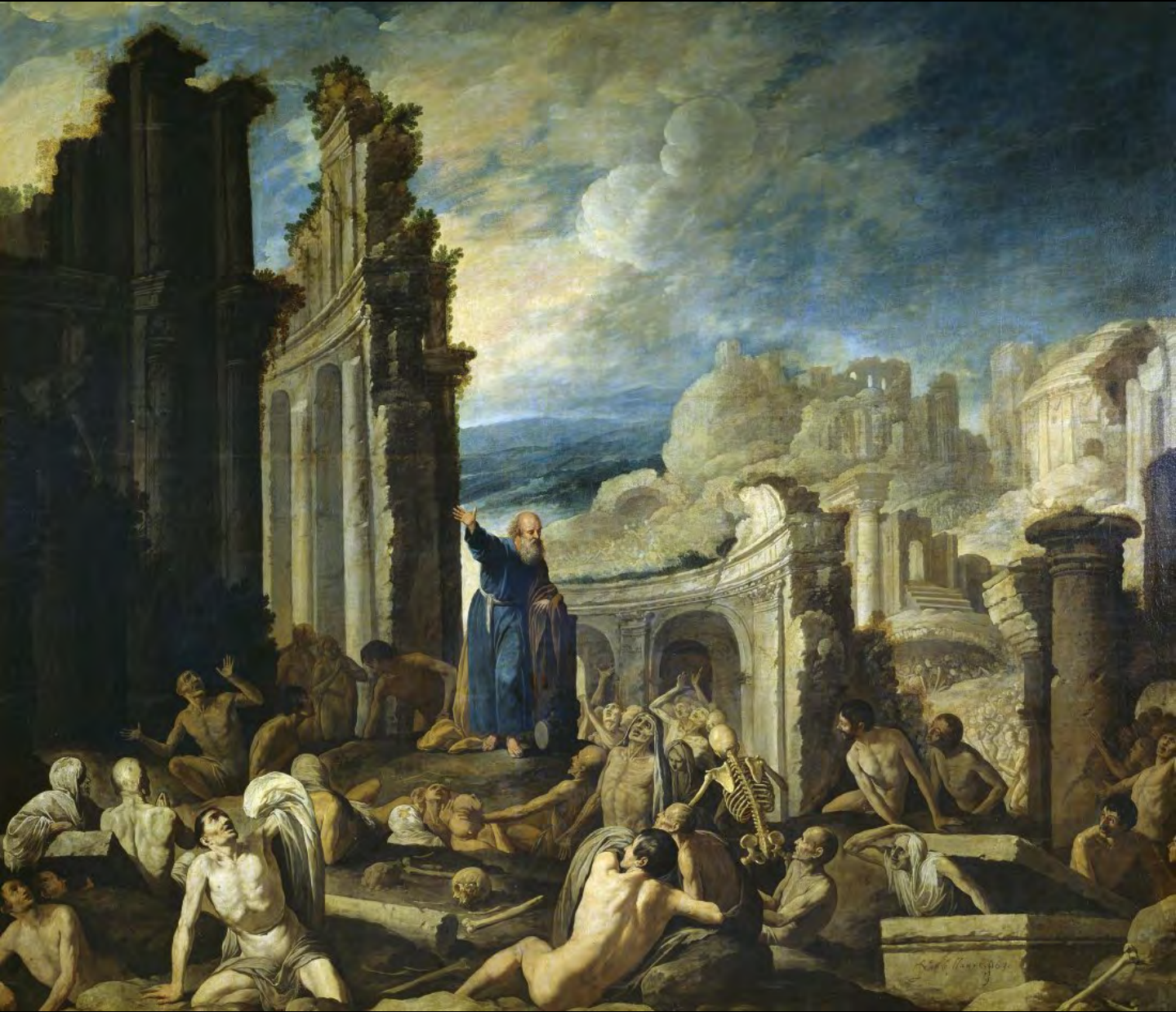
The Vision of Ezekiel by Francisco Collantes Cir 1630