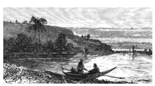
Site of Capernaum

Setting: Capernaum ( Caper : "village"; Naum from the town of Capernaum, a fishing village, located beside the Sea of Galilee, the former home of the