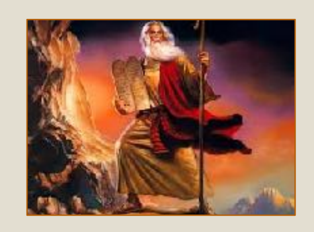
Biblical Character Sketches "greater riches than the treasures in Egypt" Hebrews 11:26