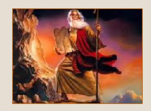
Biblical Character Sketches greater riches than the treasures in Egypt" Hebrews 11:26