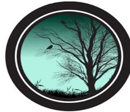
Darkness Exodus 10:21-29