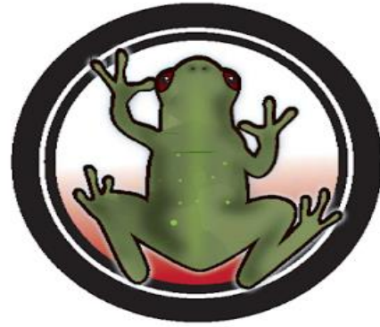
Amphibians (Frogs) Exodus 7:26-8:11