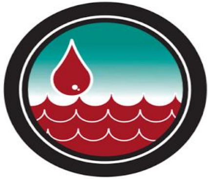
Waters Turn to Blood Exodus 7:14-25