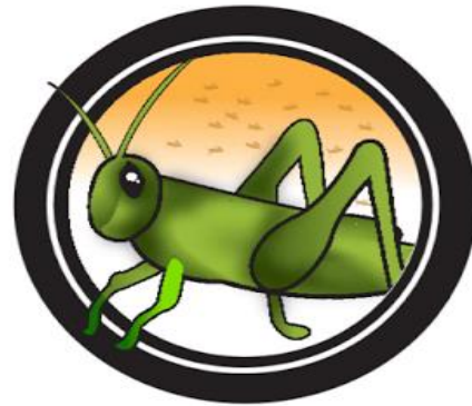
Locusts Exodus 10:1-20