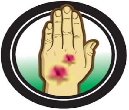
Unhealable Boils Exodus 9:8-12