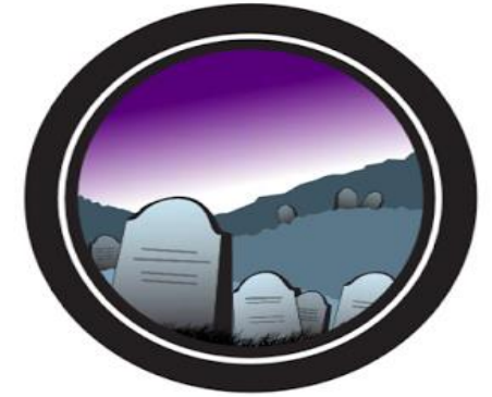
Death of First-Born Exodus 11:1-12:36