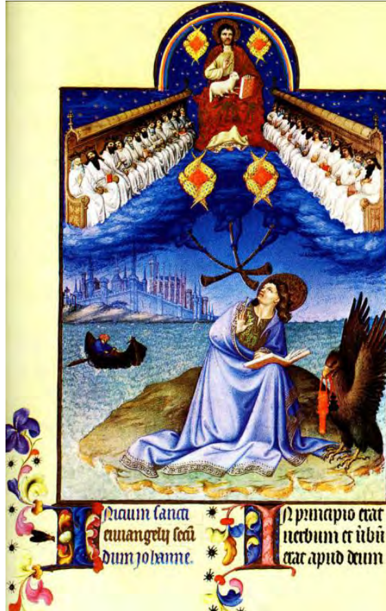
Saint John on Pathmos by Van Limburg Brothers cir 1413-16