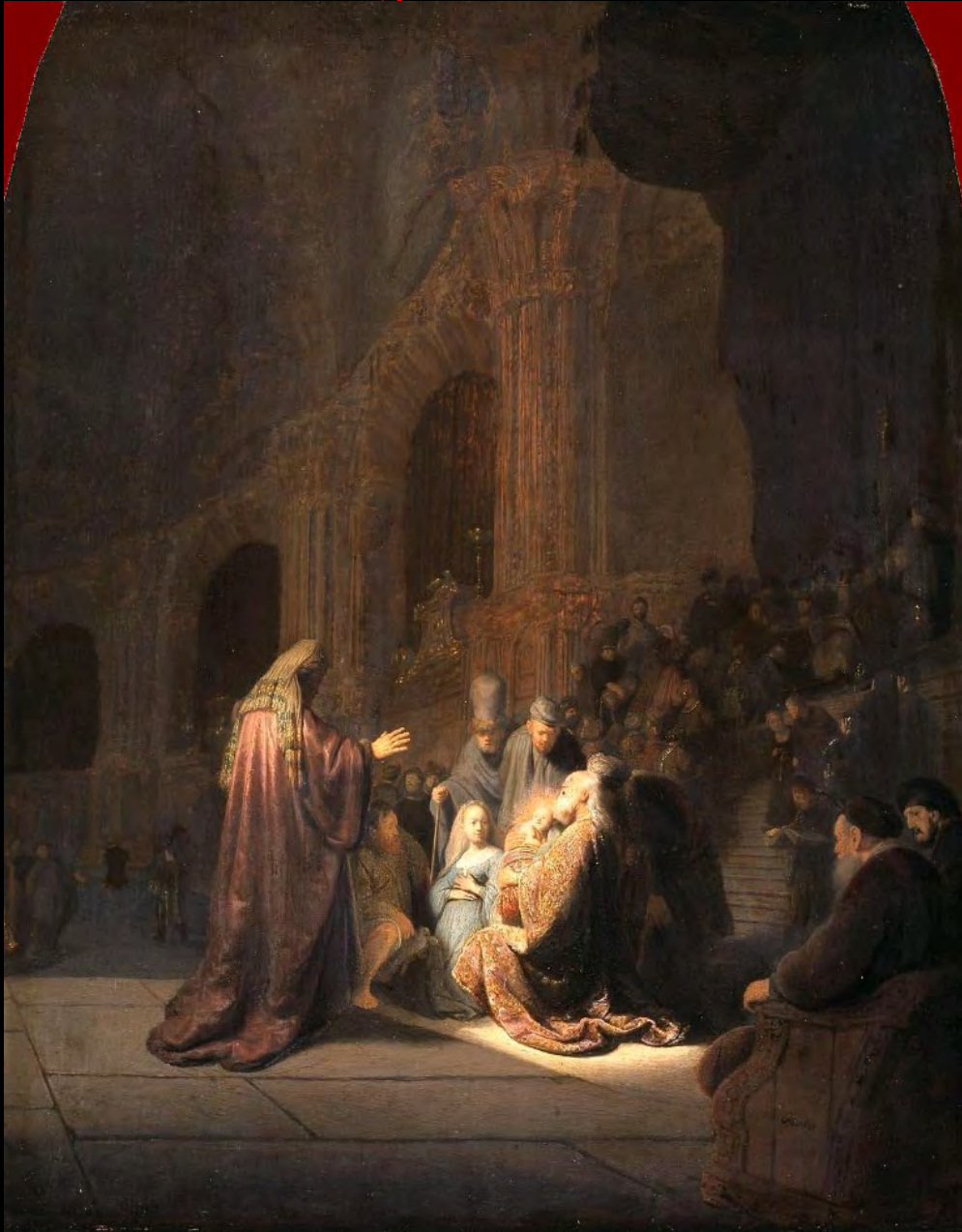
Simeon's Song of Praise by Rembrandt Cir. 1631

Millennial Kingdom Will be Holy February 16, 2014