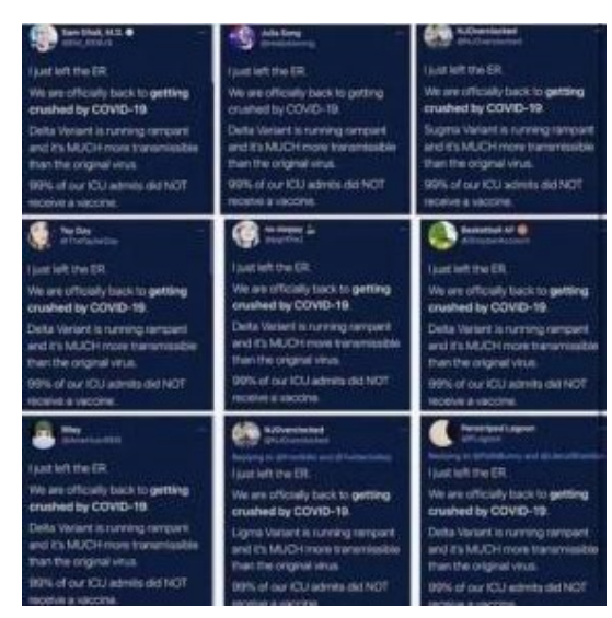
This image and the one below shows more Twitter "bots" spreading messages of fear, paranoia and fascism.

In spite of this, governments and businesses are now mandating that employees/customers cannot work/shop in establishments unless they show proof of receiving the