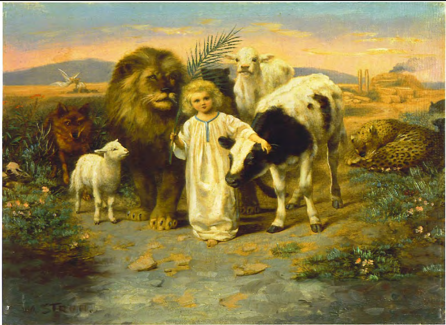
Peace By William Strutt Cir 1896 depicting Isaiah 11:6-7