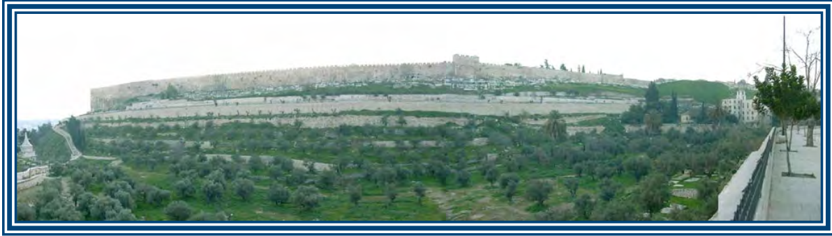
The Valley of Jehoshaphat looking West toward the Temple Mount