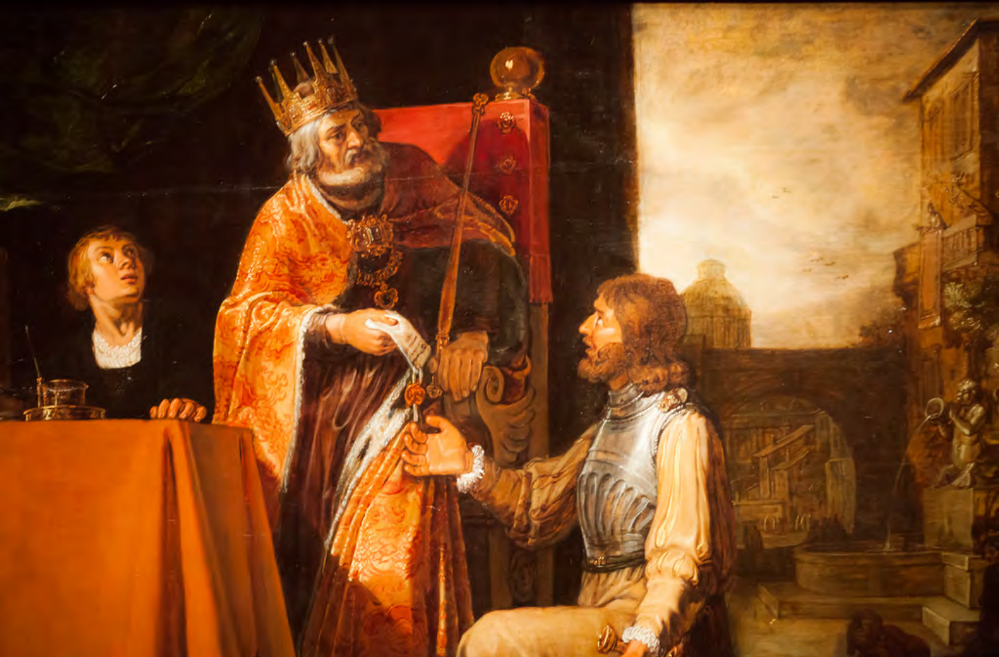
King David Handling the letter to Uriah.